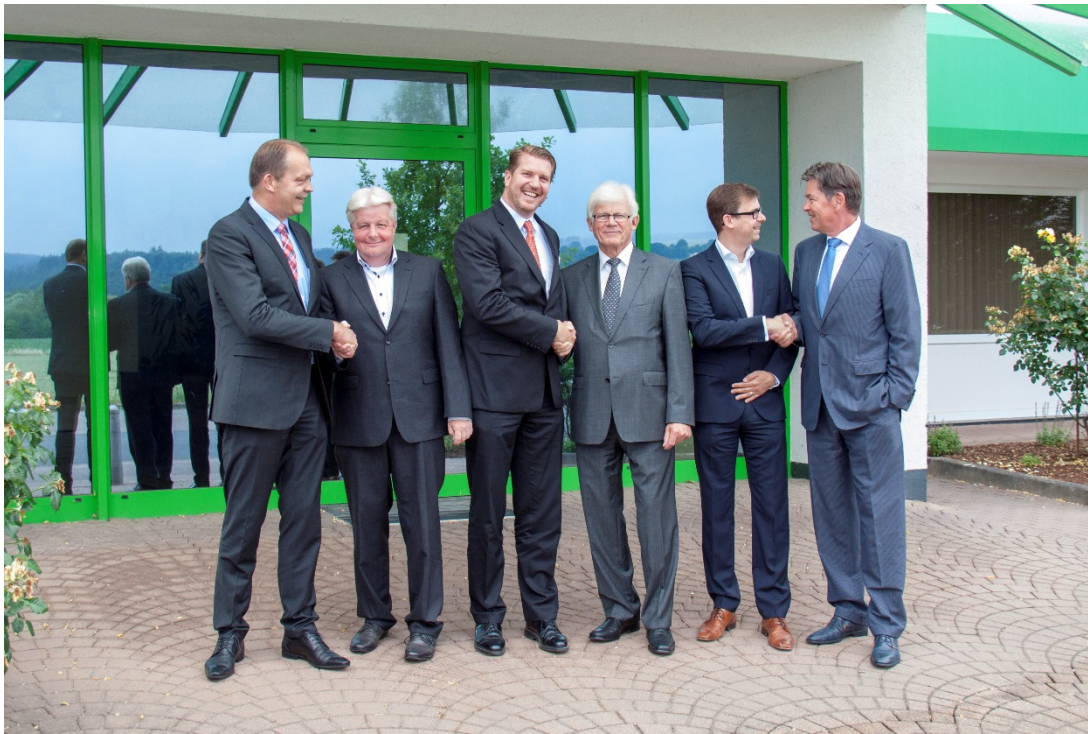
Figure 1: Launch of HEGLA-HANIC GmbH as an independent company of the HEGLA Group